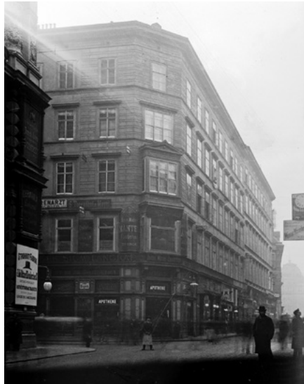
Store Location Rotenturmstraße, Vienna

VIENNESE ELEGANCE MEETS TECHNICAL EXCELLENCE