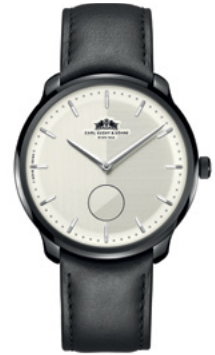
Black Case Silver Dial