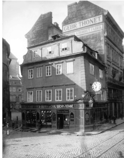
Carl Suchy & Söhne flagship store at Wenzelsplatz, Prague

Carl Suchy & Söhne returns with the limited-series luxury watch Waltz N°1, made by hand in Switzerland. Carl Suchy & Söhne watches have always displayed highest aesthetics and innovation. All timepieces were signed off personally by the watchmaker himself. To bear his name, they had to “exceed the expectation of the highest classes of society in regard to refined elegance and technical perfection.”