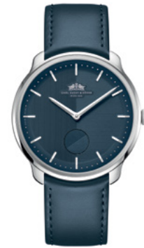
Stainless Steel Case Blue Dial