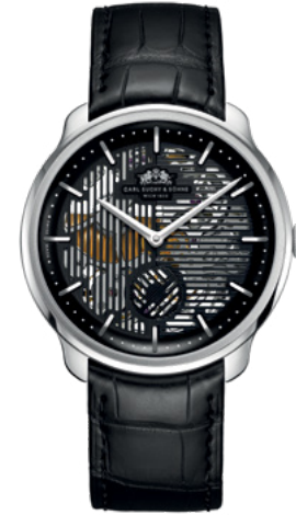
Stainless Steel Case Black Dial