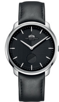
Stainless Steel Case Black Dial