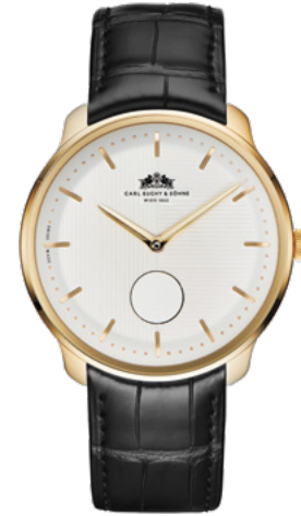
Gold Silver Dial