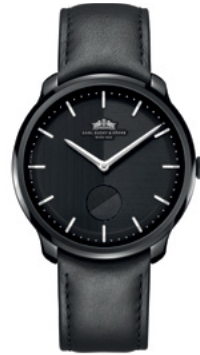
Black Case Black Dial