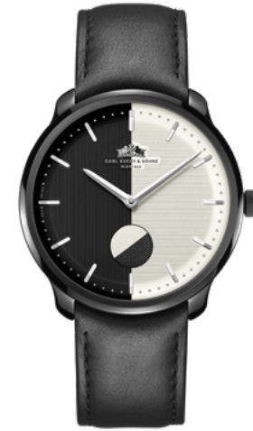
Black Case Silver and Black Dial