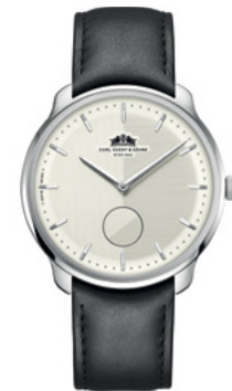
Stainless Steel Case Silver Dial