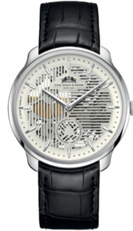
Stainless Steel Case Silver Dial