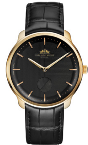
Gold Black Dial