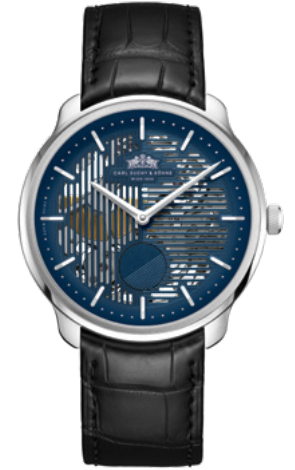
Stainless Steel Case Blue Dial